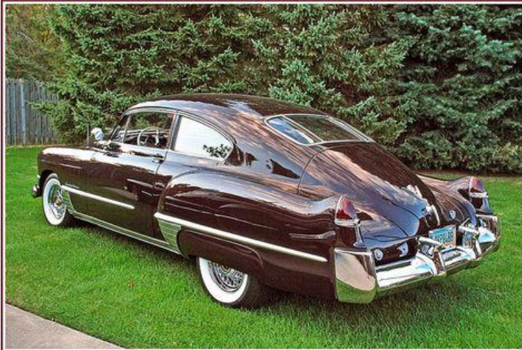
* 1949 Cadillac Series 62 Sedan *