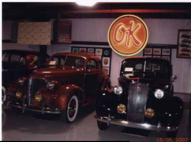
Just 2 of Tom Meleo's magnificent Chevys