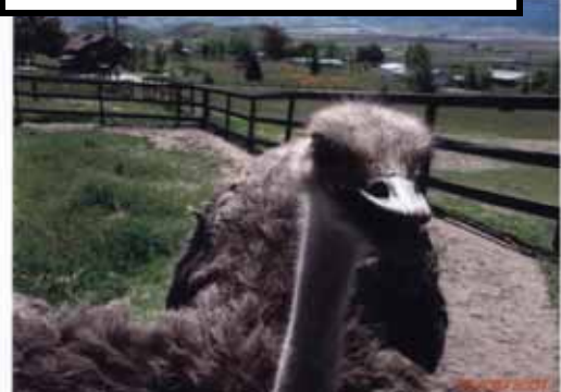
You might be stupid, but you taste good.