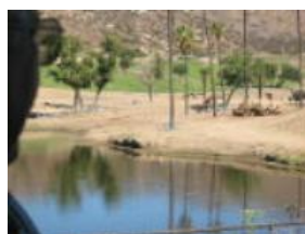
IMG_2400.JPG What? No crocs?