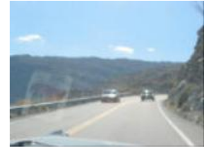
IMG_2377.JPG Rugged country