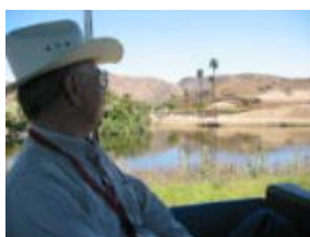
IMG_2399.JPG Now ya got it!