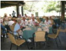
IMG_2410.JPG And mostly talkin'