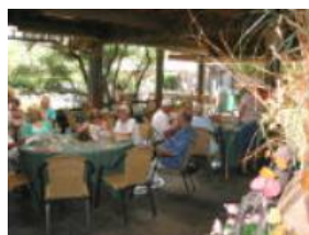
IMG_2408.JPG Feeding the visitors in the Mombasa room.