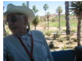
IMG_2397.JPG BK, look the other way!