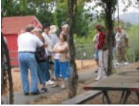
IMG_2430.JPG Bennit sneaks a hug