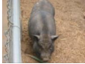
IMG_2431.JPG Porky's cousin