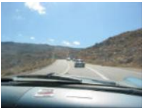
IMG_2378.JPG Temp gauges climbing!