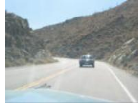
IMG_2376.JPG Rugged country