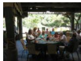
IMG_2409.JPG Talin' n' eatin' and California Dream'n