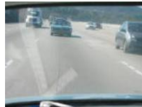
IMG_2380.JPG How'd he get behind us?