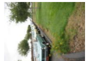
IMG_2453.JPG Grandma's Onions at the Simson's Nurserv