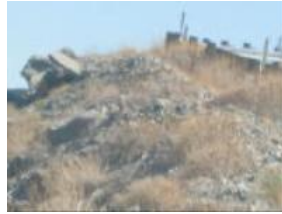
IMG_2375.JPG Rugged country