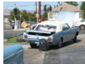
IMG_2468.JPG Most times "the shoot horses, don't they?"