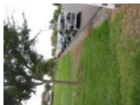
IMG_2451.JPG Grandma's Onions at the Simson's Nurserv