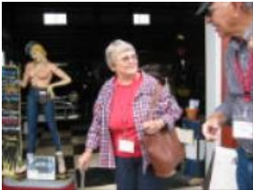
IMG_2438.JPG This ain't no place for a lady like you!