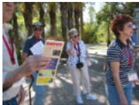
IMG_2391.JPG Follow me! I've got a map!