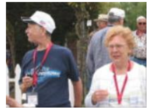
IMG_2425.JPG Weber duo