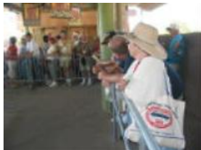
IMG_2395.JPG And, we're waiting...