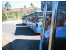
IMG_2396.JPG And, we're off!