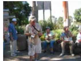
IMG_2393.JPG Resting weary feet.