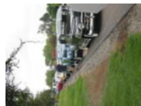
IMG_2452.JPG Grandma's Onions at the Simson's Nurserv