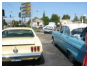
IMG_2467.JPG The scene is set.

Spread out the tools and make it look professional.