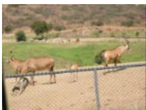
IMG_2406.JPG Somehow, Mama, those Jerseys don't look like the ones in Iowa