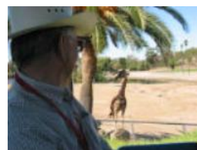
IMG_2401.JPG Heads up! Giraffes to the left.