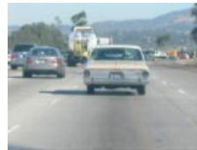
IMG_2384.JPG Earlier on as we left San Diego for Alphy's house