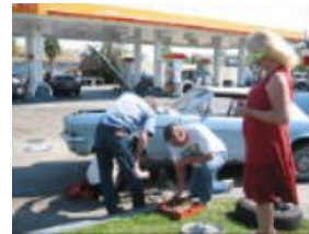
IMG_2464.JPG Engineering a fix