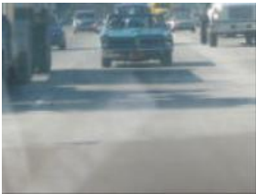
IMG_2382.JPG Good looking GTO in my rearview mirror.