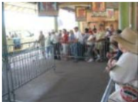
IMG_2394.JPG Waiting for the tram to ride out to see the big animals.