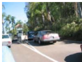
IMG_2387.JPG The Higday's T-Bird escorts the Mob Limo into the park.