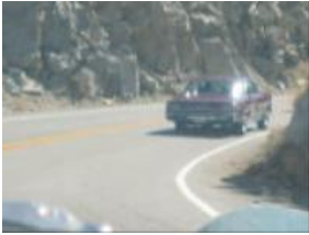
IMG_2374.JPG The Pass from Palm Springs to San Diego