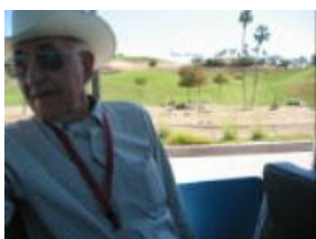
IMG_2398.JPG No, the other other way!