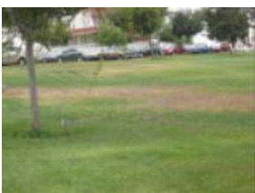
IMG_2454.JPG Grandma's Onions at the Simpson's Nursery